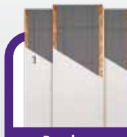
Panels measure 21.75" Wide x 96" High