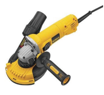
Use for grinding foundation wall **USE DIAMOND CUP WHEEL