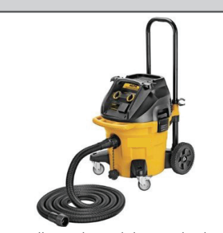
Collects dust while attached to grinder and shroud tools

Tuck Point Grinder with Dust Shroud Attachment