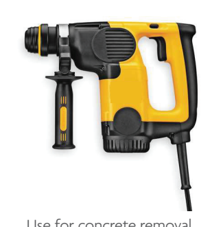
Use for concrete removal **USE CHISEL OR SPADE TIP ATTACHMENT