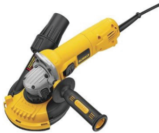
Use for grinding foundation wall **USE DIAMOND CUP WHEEL