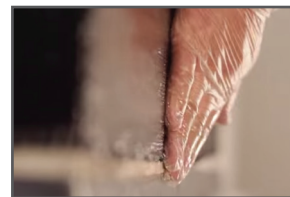
02: Work carbon fiber into epoxy. Add more epoxy if necessary.