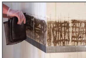
01: Mount carbon fiber to the wall

Tools: gloves, epoxy gun, carbon fiber, epoxy, plastic putty knife (optional)