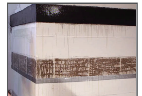
03: Repeat process to additional sections