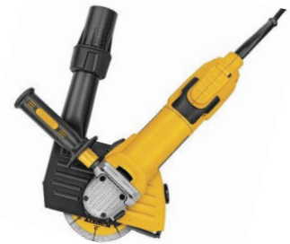
Use to tuckpoint joints of cracks **USE DIAMOND EDGE BLADE