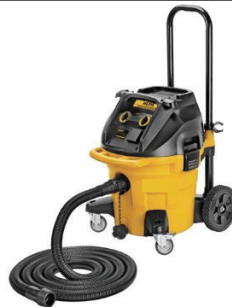
Collects dust while attached to grinder and shroud tools